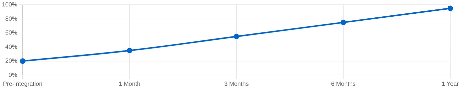
Integration Impact on Business Growth